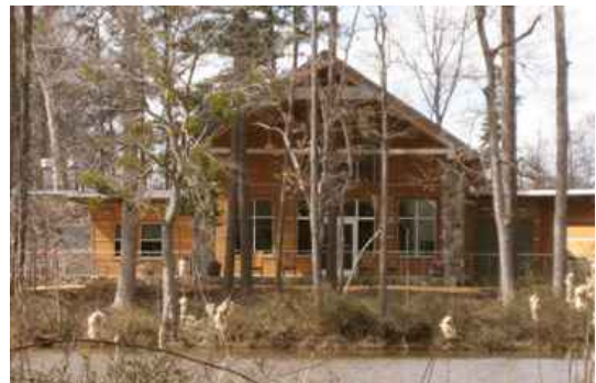
Classroom; steps from the mill and large pond with walkways